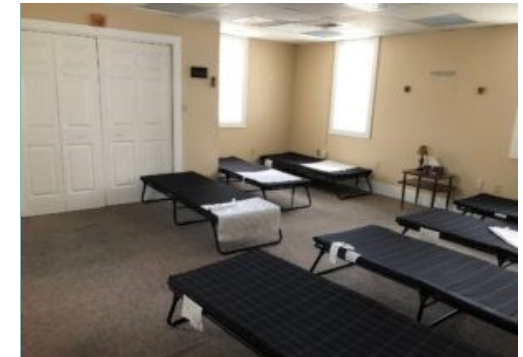
Multiple Sleeping Areas

More local attractions and information on restaurants, groceries, drug stores, etc. will be provided at orientation.