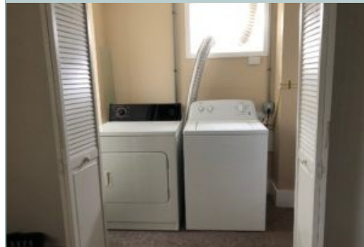
Laundry Facility on Upper Level

More local attractions and information on restaurants, groceries, drug stores, etc. will be provided at orientation.