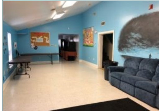
Gathering Space on Lower Level