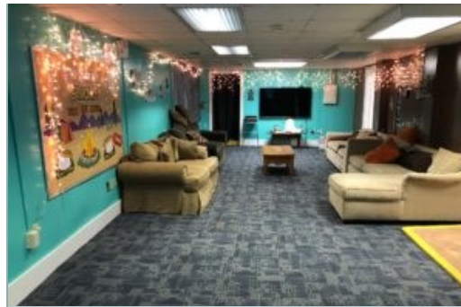
Living Room on Lower Level